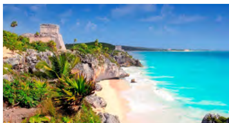
Transportation Options | All classes of air service, private transfers, car rentals, trains, ferries and more