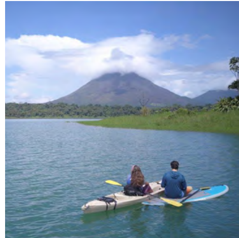
Advisor Resource Center | Meet the Journese Team, customizable flyers, incentive details and more