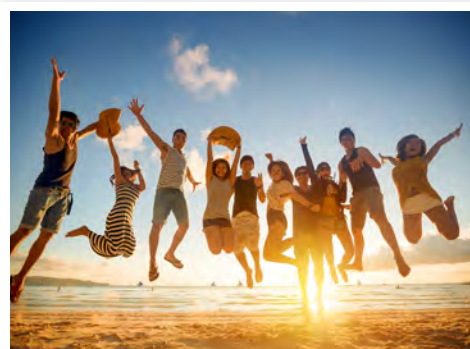
Contracted & Boutique Groups | Dedicated Groups, Boutique Groups and Wedding Specialists