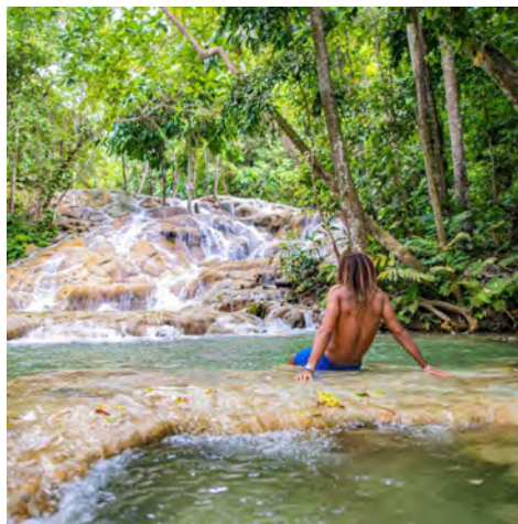
Sample Itineraries & Insider Tips | Online for ease in planning your clients' vacations