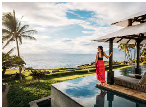
Traveler Promotions | Exclusive rates, complimentary nights, daily breakfast, resort credits and more