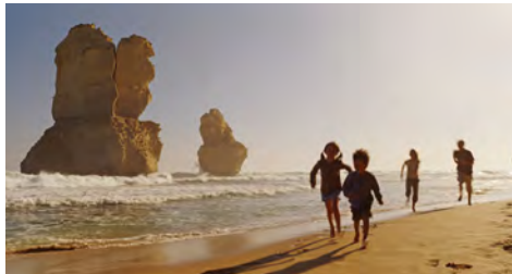
Advisor-Only Booking Engine | Book & Quote online, anytime