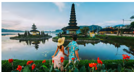
ELITE Webinars | Exclusive training program with live and on-demand presentations