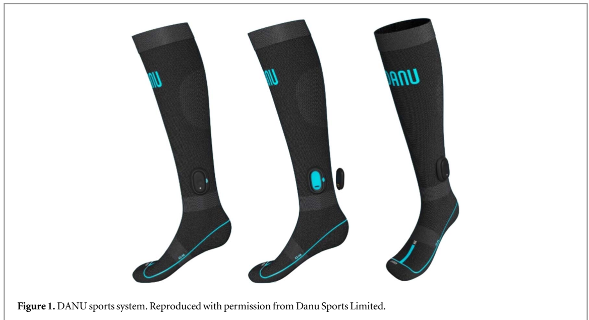
Figure 1. DANU sports system. Reproduced with permission from Danu Sports Limited.

shanks, and two feet). A normal gait cycle was defined from the initial heel-to-heel contact with the same limb. Additional information of the PiG calculations can be found on Vicon's website.