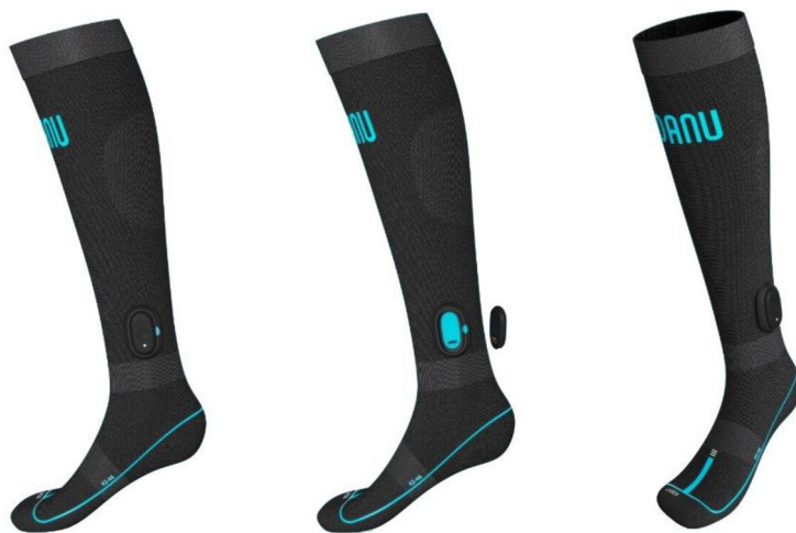
Fig 5. DANU sports system.

Prior to data collection, all participants regardless of study arm (laboratory or real-world) will complete a questionnaire to provide information pertaining to their demographics, lifetime athletic injury history, medical history, sporting pursuits and running personal bests (S1