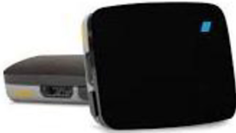
Fig 4. DorsaVi ViMove2.

https://doi.org/10.1371/journal.pone.0291289.g004