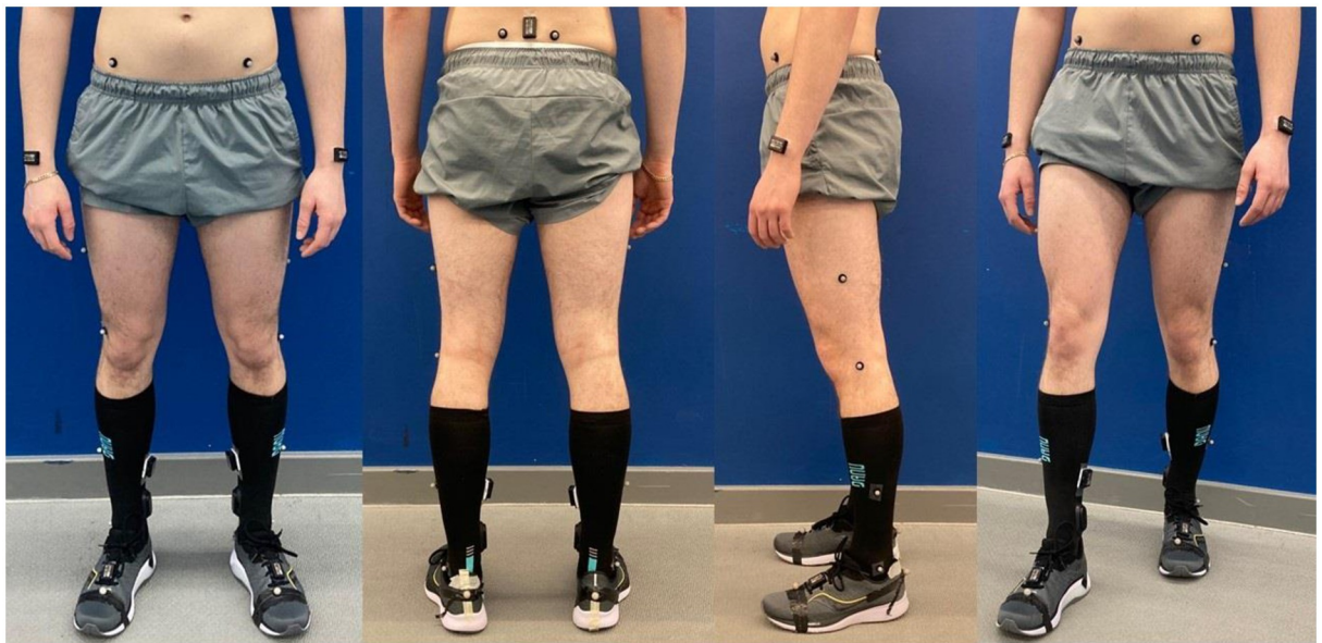
Fig 2. Participants' setup. The positions for the three grades of wearables and reflective markers for 3D motion capture are shown.

Typically, research-grade devices require users to have specialist / technical knowledge due to the tendency of devices to provide the raw data only. Therefore, the user often needs to create and implement algorithms to achieve tangible outcomes. However, these devices offer the flexibility to define wear location and creation of novel outcomes [27]. Consumer level / commercial wearables with proprietary software are sought to be user-friendly, requiring little technical knowledge or experience, producing outcomes automatically. For these devices, it is often unclear how reference limits are set, or established for such functions [27]. Rather than showing the raw data collected by the wearable, users typically export information after it has been analysed and filtered through an algorithm. More advanced multi-modal devices (e.g., combined IMU and pressure sensors in a single system) offer numerous sensing capabilities with multiple algorithms that are enabling laboratory grade sensing in any location.