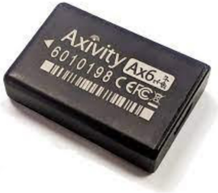
Fig 3. Axivity AX6.

https://doi.org/10.1371/journal.pone.0291289.g003