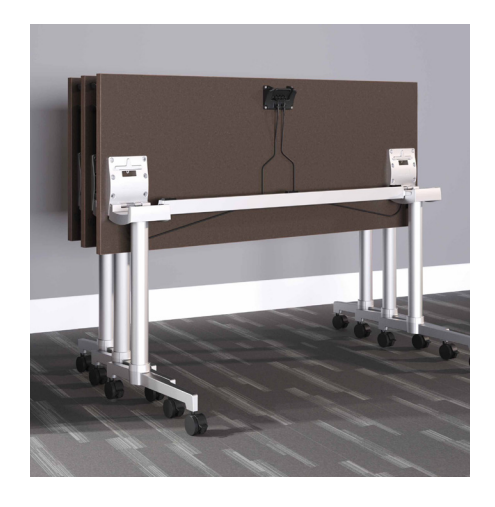
Easily tilt and store with an offset or inline nesting feature.