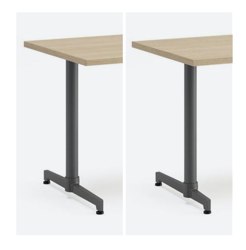
Two base style options include a T base and a Cantilever base.