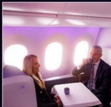
Business Premier Luxe