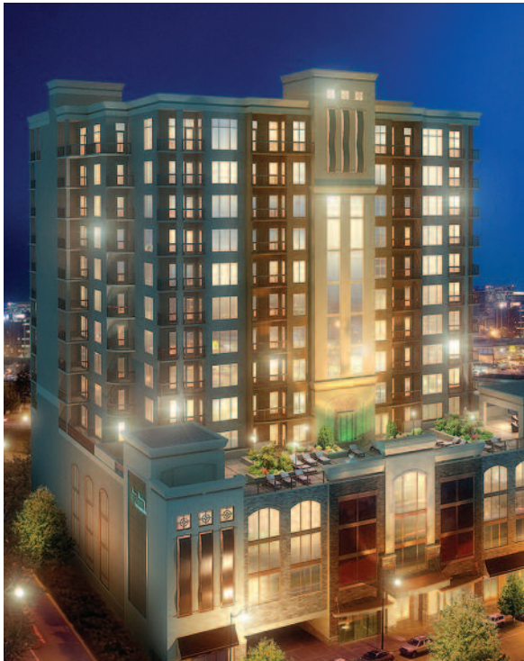
Rhythm at Music Row, Nashville, TN Architect: Wakefield Beasley & Associates